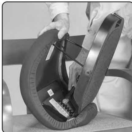
Select a weight setting suited to the user and center lifting mechanism between the appropriate slots.