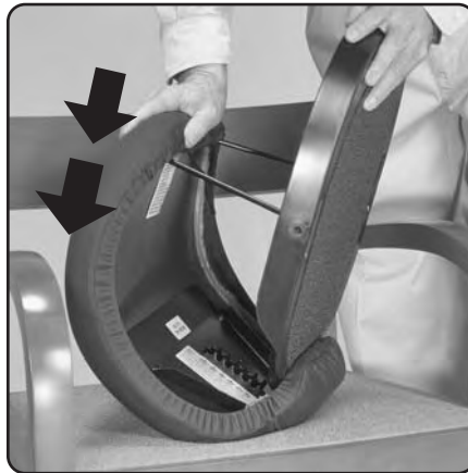
Push down , flexing the upholstered part of the seat.

3 Select a weight setting. Center the lifting mechanism pin between the two grooves for user's appropriate weight. Make sure it is fitted securely in the center of the weight slots. (The printed numbers on the setting gauge are only a guideline. The setting you choose should be according to the user's ability and preference. Choosing a weaker setting will still allow a gentle lowering into the chair but will not provide as much force on rising.)